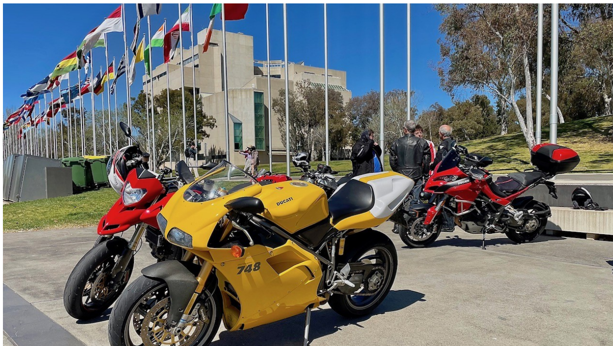
A few Duc's by the pond.

sports-bike was a blast. Meanwhile the rest of the rabble were nestled comfortably on their armchair strudels.