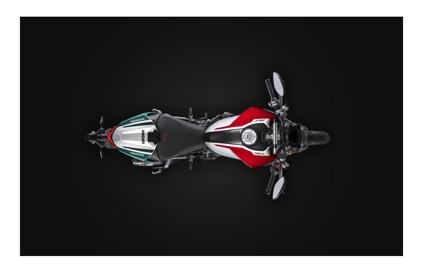
Suggested Ride Away Price From $29,100 AUD