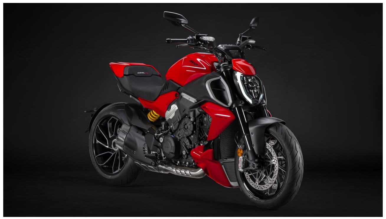
The new barge Christmas wish