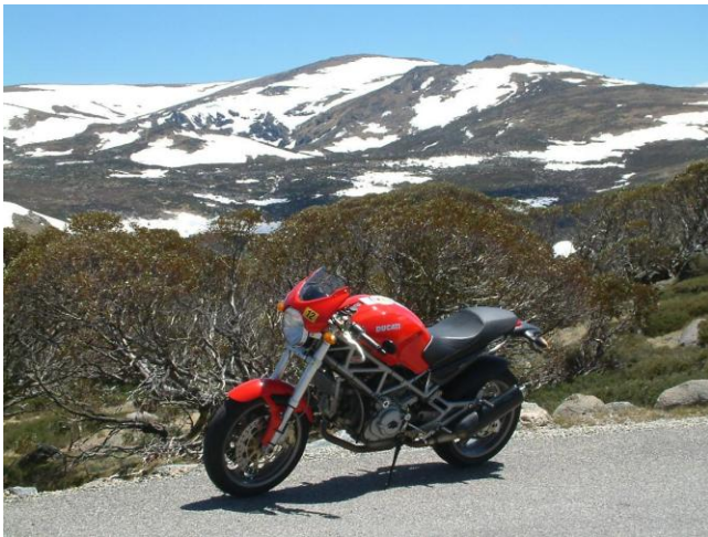
A pic from Khancoban Runs past to wet your appetite

It's on again – Sat November XX th & Sun 19 th is the annual CDDC Khancoban Run. Why do we do it every year??? Cause it is on the best riding roads and looking at the best scenery in Australia. It is also the first run after the Winter hiatus and a chance to clear the cobwebs and stretch the Duck's legs. The Alpine Inn is doing a dinner, bed & brekkie package for us @ $58 for small rooms at back or $70 for larger front rooms. Do it yourself bookings on 02-60769471. 1st in gets the best room!!