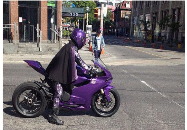
Purple girl riding a purple Panigale

PS. Mum, none of this is true. I'm over at the neighbour's house. I just wanted to remind you that there are worse things in life than my school report card which is in my desk centre drawer. I love you! Call when it's safe for me to come home.